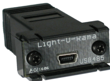
USB485—Mini-USB to RJ45 5/8" h x 1 3/8" w x 2" d