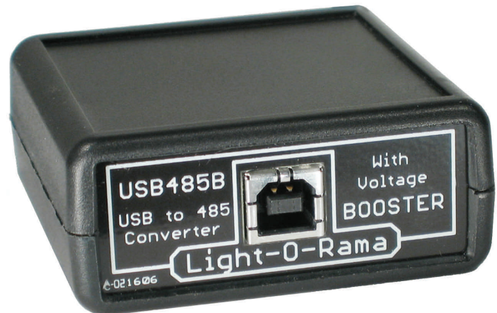
USB-B to double RJ45 1 1/8" h x 2 5/8" w x 2 5/8" d