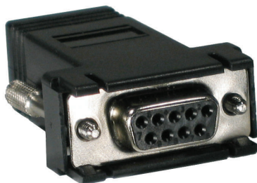
SC485—9-pin serial to RJ45 5/8" h x 1 3/8" w x 2" d

Must be within 100 feet of first controller