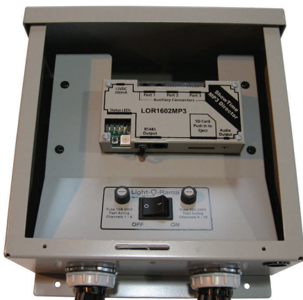
LOR1602MP3 package Shown with cover removed

Can be powered by a controller, so you just turn on power to the controller to start the show. Or, it can be powered by a 12VDC power brick that you can turn on and off to control the show.